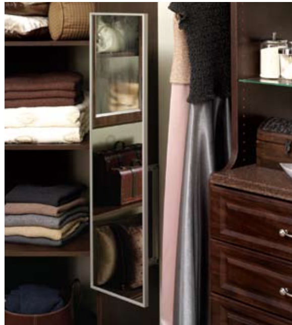
Shown in Mocha.