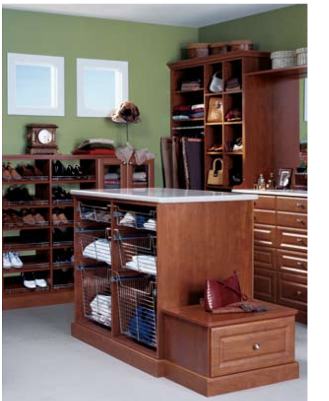
Top shown in Taos Cherry veneer. Bottom in Light Cherry.