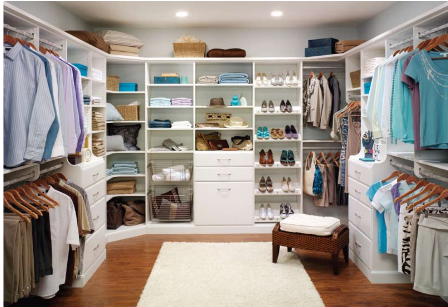
Shown in White.