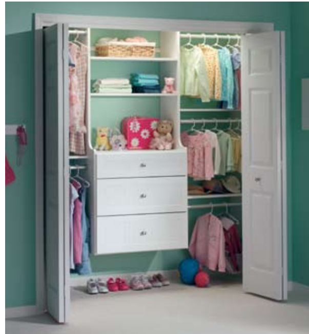
Shown in White.

Get your teen organized from wardrobe to workspace. A lifetime of creativity starts at this simple desk fit for homework, web-surfing or artistic endeavor. ORGwall and the hooks and racks it supports place prized possessions within eyeshot and arm's reach.